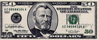
Ulysses S. Grant