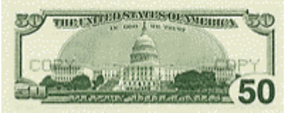
U.S. Capitol, Washington, D.C.