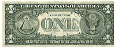
Great Seal of America