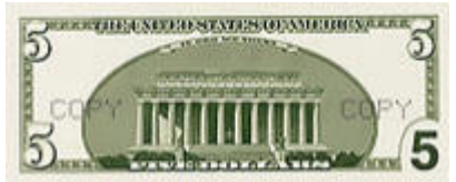
Lincoln Memorial, Washington, D.C.