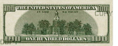
Independence Hall, Philadelphia, PA