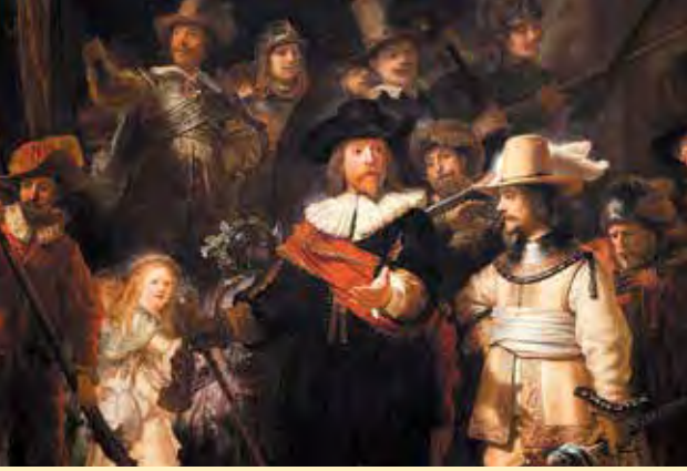
In the world-class Rijksmuseum, view Dutch Golden Age masterpieces, including Rembrandt's The Night Watch.