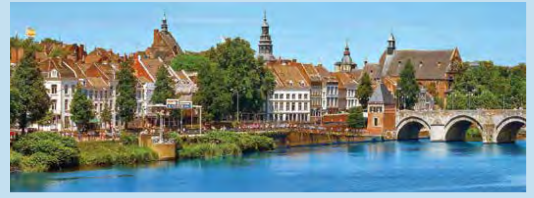
Photo below: Maastricht on the River Meuse is widely considered to be one of the oldest towns in Holland.

Cover photo: Cruise through Holland, where tulip blooms announce the arrival of spring.