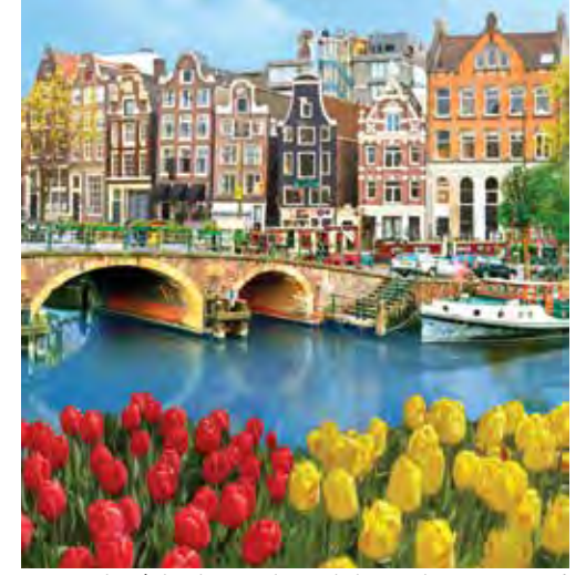
Amsterdam's bridges and canals bring the intimacy of a small town to one of Europe's most celebrated cities.