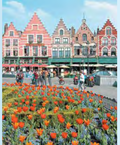
The lively, medieval Markt is the principal city square and gathering point in Bruges.